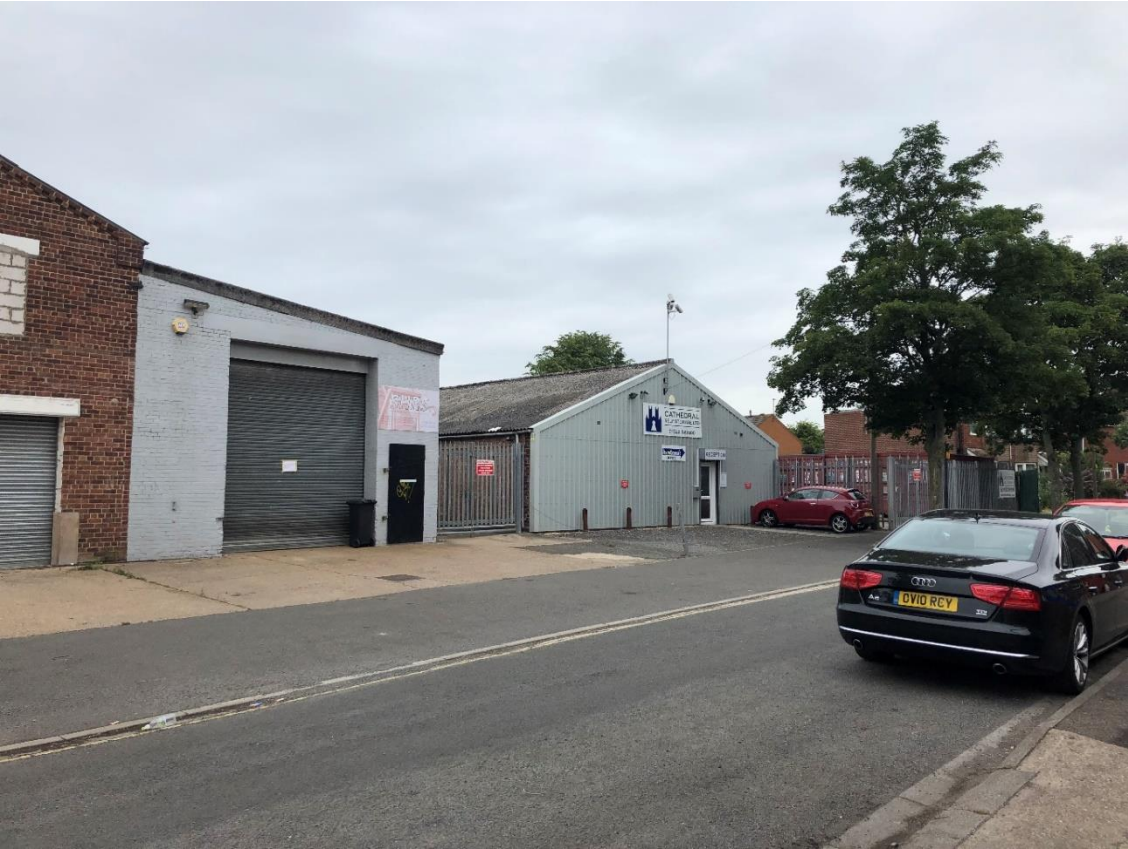
Existing Cathedral Self Storage business