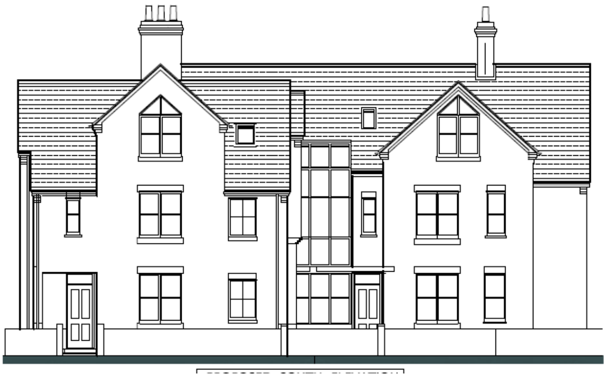
Front, south elevation of apartment building