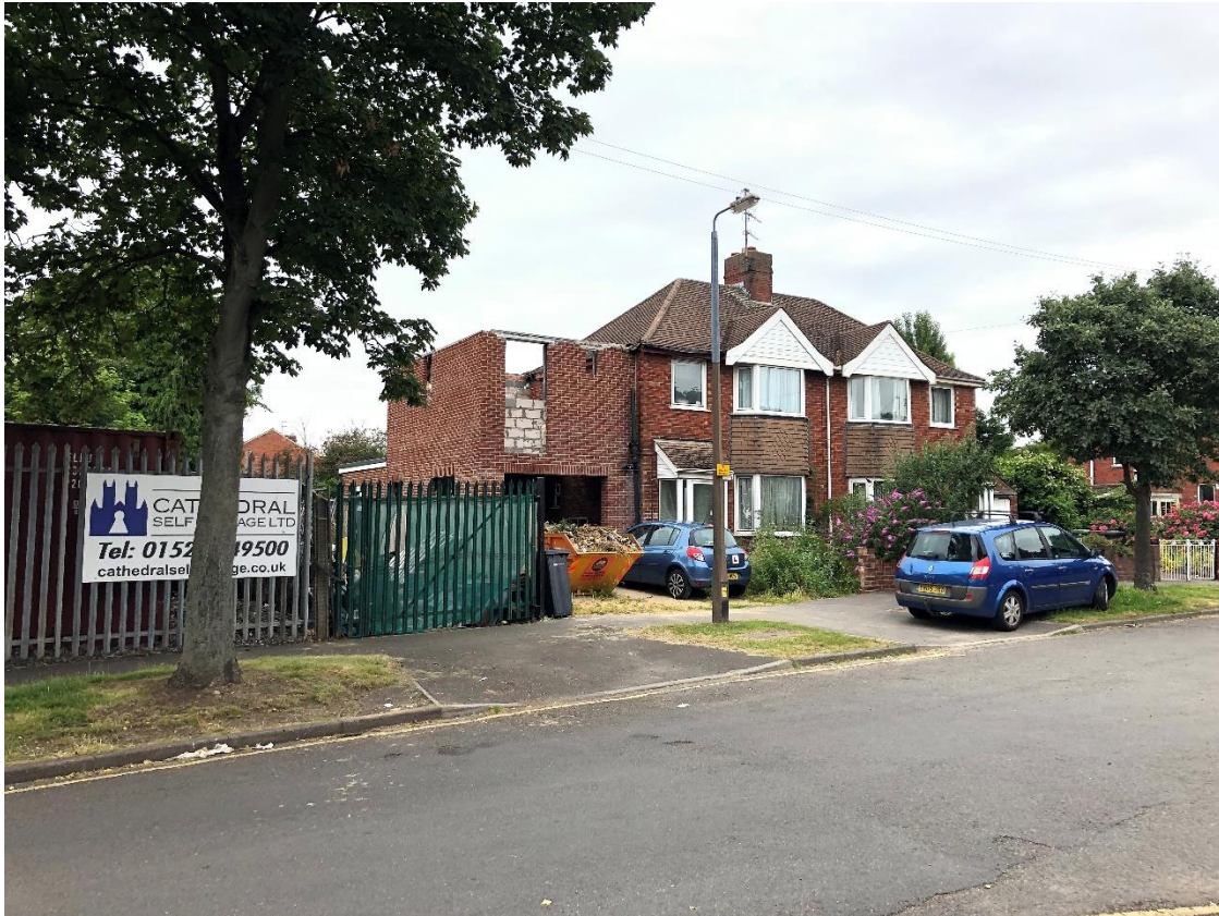
Parcel of land adjacent to site (behind green palisade fence) and 12 Kingsway beyond