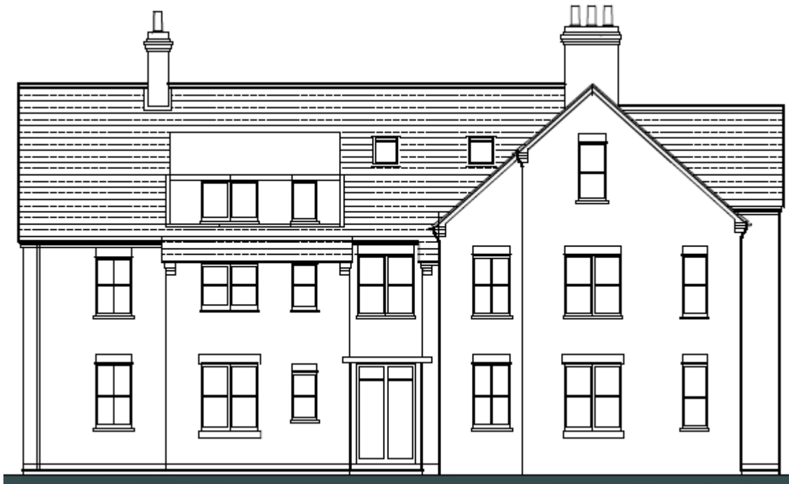
Rear, north elevation of apartment building