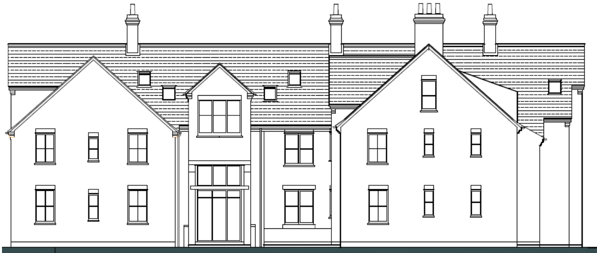
Side, east elevation of apartment building