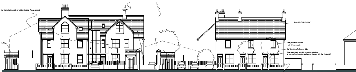
Proposed site frontage from Kingsway