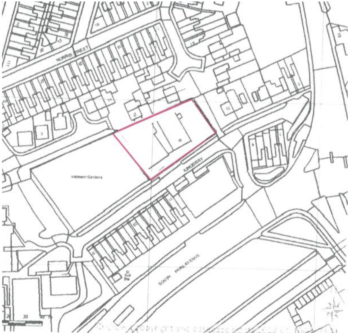
Site location plan