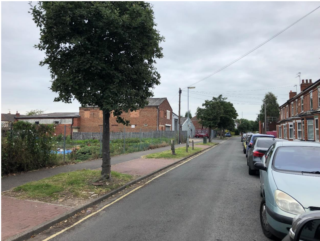
Site from Kingsway looking east across allotment gardens