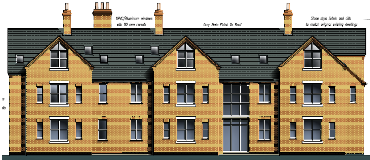
Side, west elevation of apartment building