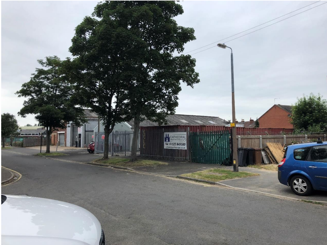
Site from Kingsway looking west