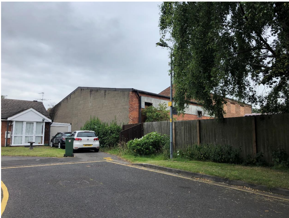
View of 15 St. Andrews Close and rear elevation of warehouse/site boundary